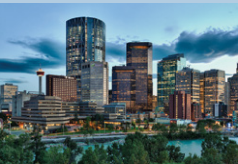
Exhibit Again to Top E&P Buyers. Rebook for 2019.